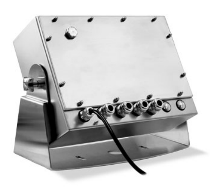
Rear panel configured for extra outputs