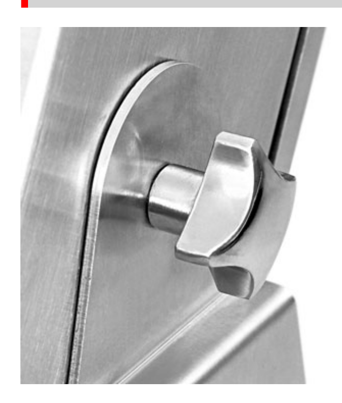
STAINLESS steel inclination adjustment system