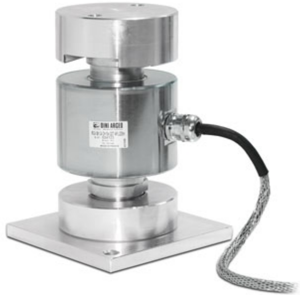
RCA load cell complete with optional KRCA kit.